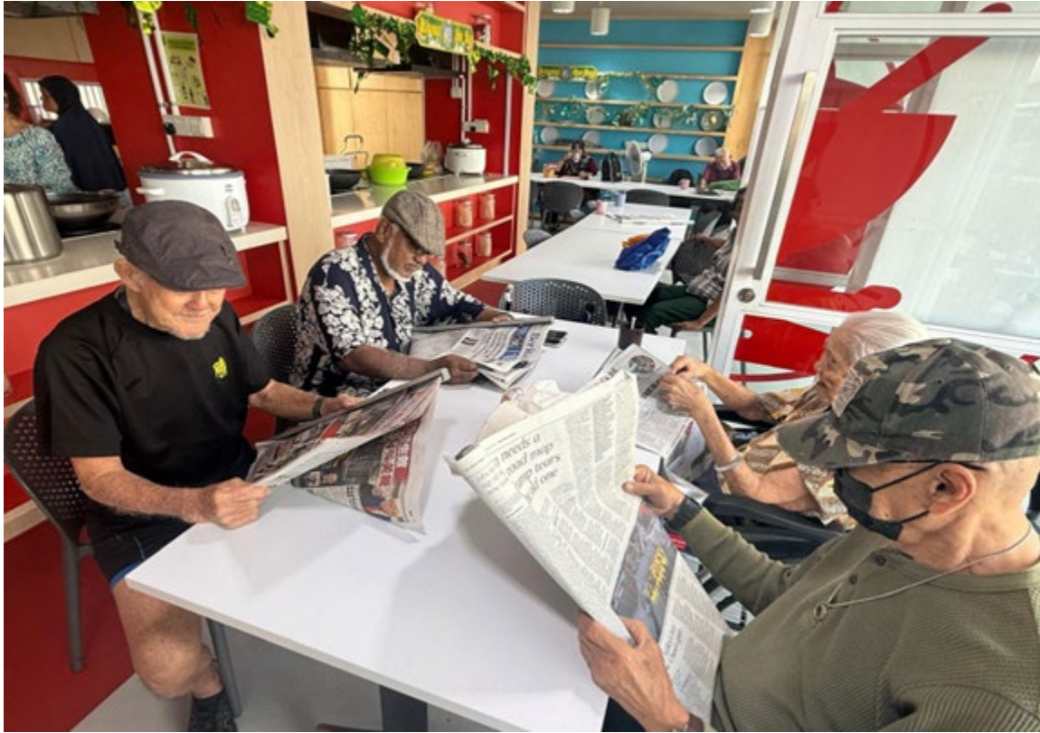
Seniors at Goodlife Makan Active Ageing Centre, managed by Montfort Care enjoying their daily dose of news from news publications sponsored by SPH Foundation.

In 2024, SPH Foundation supported SPH Media Academy (SMA) for the first time in its efforts to build media capacity and capability. The Foundation sponsored 3 training programmes for journalists — namely the First-line Editors Leadership Development Programme, Media Law, and Foundations of Visual Journalism. A total of 67 local media professionals, including editors, videographers, digital designers and journalists attended the three programmes, which received positive feedback from the participants.