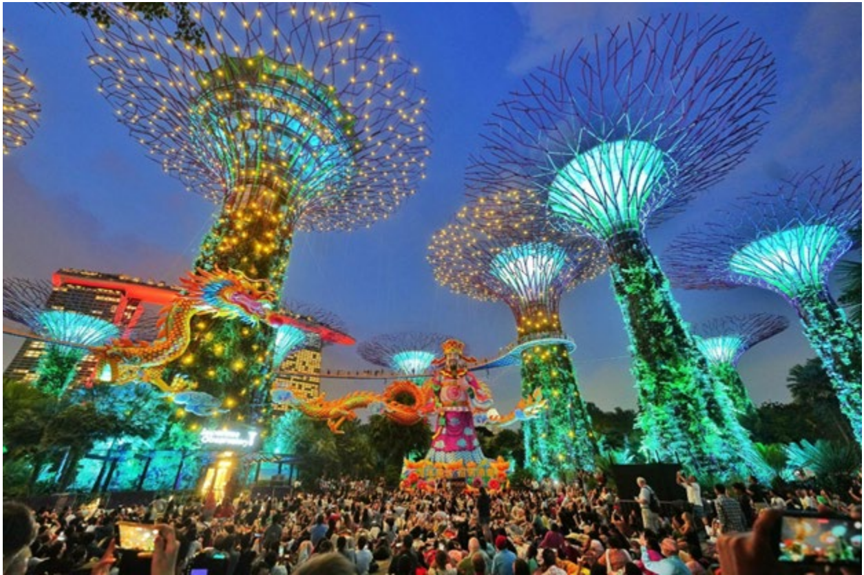
The annual Lunar New Year event River Hong Bao promotes Chinese culture and community bonding among all races.

SPH Foundation sponsored the City Reading @ SG festival for the second time in 2024. The event, organised by SPH Media's Chinese Media Group, aimed to promote the love for reading, media literacy and community engagement through a variety of activities such as talks, workshops, book sharing and launches. Last year's event, which ran from 24 May to 2 June 2024, showcased talks and other literary activities, including a book fair, attracting over 3,000 participants and achieving 18,700 online engagements, which is 4,000 more than in 2023. The festival's website also recorded a remarkable 119,025 page views, nearly doubling the total of 60,000 page views in 2023.