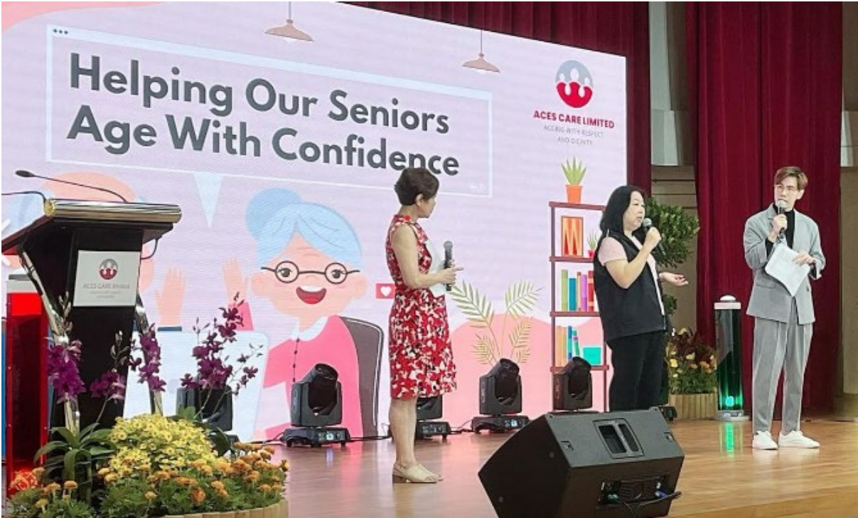
SPH Foundation funded the Aces Care Helpline Project, an initiative which engages senior volunteers to be call agents to help other seniors.

SPH Foundation sponsored Aces Care's Helpline Project to fund the set-up of their integrated call centre which allows seniors to share their concerns, fears, anxiety, and requests. Senior volunteers are trained to become call agents to handle and respond to the needs of other needy elderly. The initiative was launched by Prime Minister Lee Hsien Loong on 6 June 2022 at Teck Ghee Community Centre.