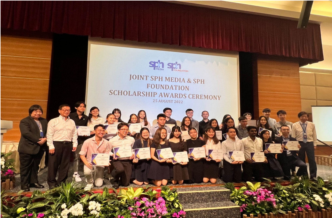
The Lim Kim San Memorial Scholarship Awards were presented together with the SPH Media Journalism Awards at a joint award ceremony.

Another education sponsorship by the SPH Foundation was the Temasek Polytechnic Graduation Prizes. The academic prizes, in the form of cash sponsorship, were given to Temasek Polytechnic students who had performed well pursuing the Communications and Media Management course.