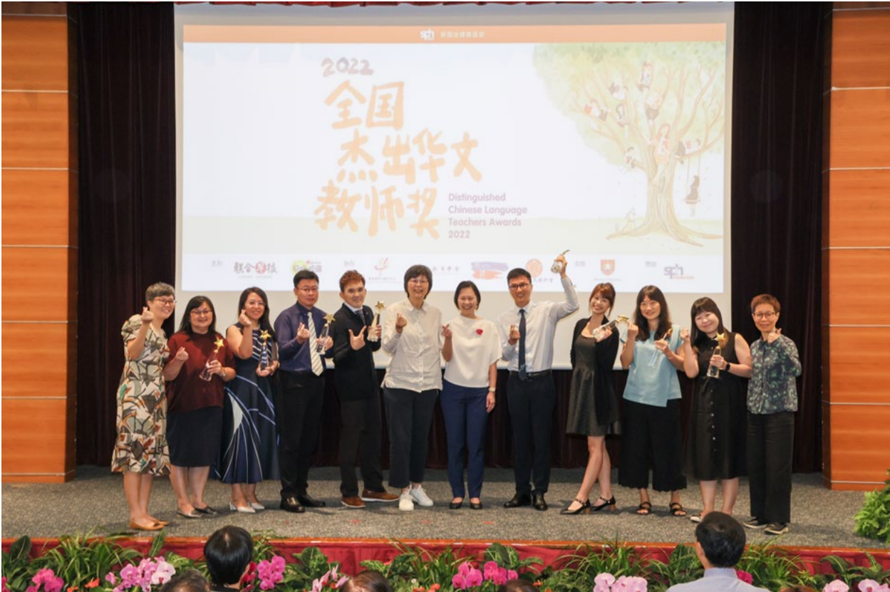
The Distinguished Chinese Language Teachers Awards recognise teachers for their dedication and innovative ways which have helped their students learn and love the Chinese language.

The Foundation continued to sponsor the Reading Corners programme for students and academic staff at various educational institutions. It sponsored newspaper subscriptions for Reading Corners in 2 polytechnics, 9 junior colleges, 3 Institute of Technical Education colleges and 7 universities. The aim of setting up the Reading Corners is to encourage Singapore youths to keep abreast of current affairs, heighten their awareness of local and global news, and cultivate the habit of reading news daily. It is also in line with SPH Foundation's objective of promoting lifelong learning.